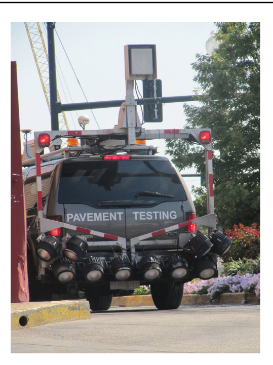
Fig. 3 Road assessment in Washington, DC